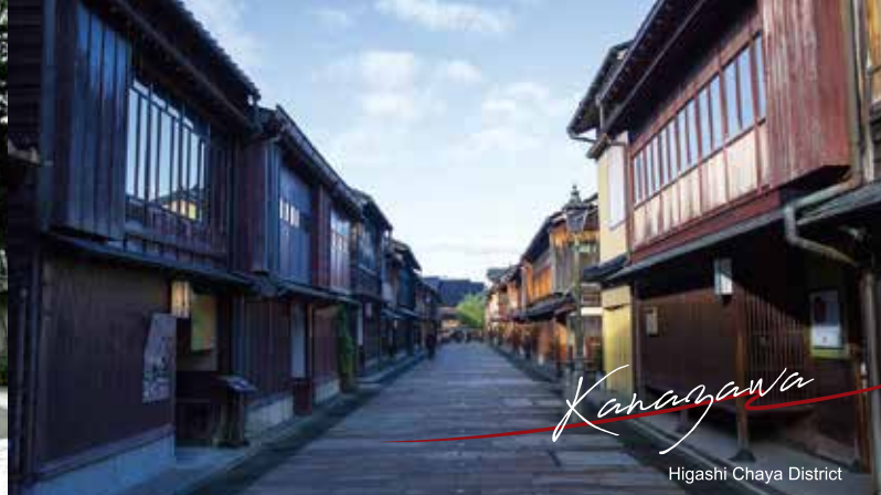
Higashi Chaya District

"Hakusan" and "Shirayama" are two different readings for the same Japanese text, literally meaning "white mountain."