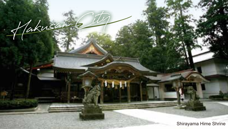
Shirayama Hime Shrine