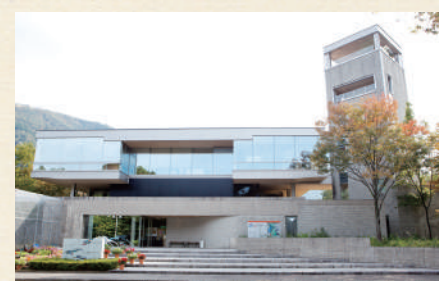
C Ishikawa Insect Museum This prefectural museum exhibits insects of the world. It has a butterfly garden with 1,000 butterflies flying about, as well as study and information areas.