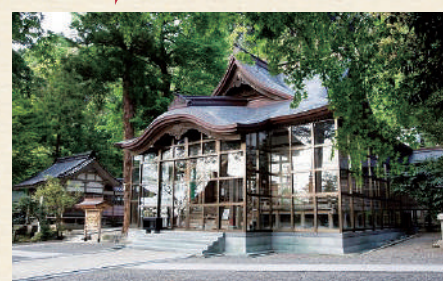
A Kinkengu Shrine This shrine is said to have been founded in 95 BC. The place name "Tsurugi" originates from the shrine's old name, "Tsurugi-no-miya"