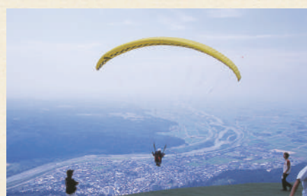
B Shishiku Highland This place has full command of the beautiful alluvial fan of the Tedoriki River. You can easily get to the top, which is famous for paragliding, by gondola.