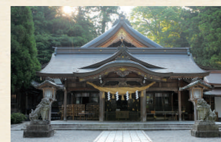
D Shirayama Hime Jinja Shrine This is the head shrine for 3,000 Hakusan Shrines in Japan, where the sacred Mt. Hakusan is worshipped. It is respected as the first shrine of the Kaga domain, and called Shirayama-san by the local residents.