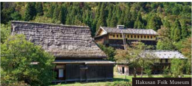
Hakusan Folk Museum