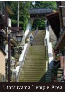
Utatsuyama Temple Area