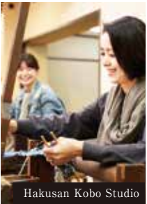
Hakusan Kobo Studio