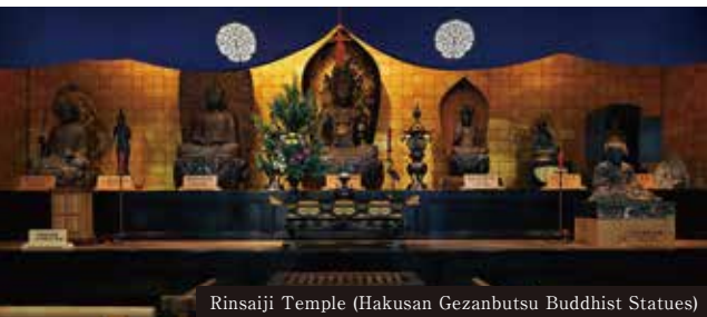
Rinsaiji Temple (Hakusan Gezanbutsu Buddhist Statues)