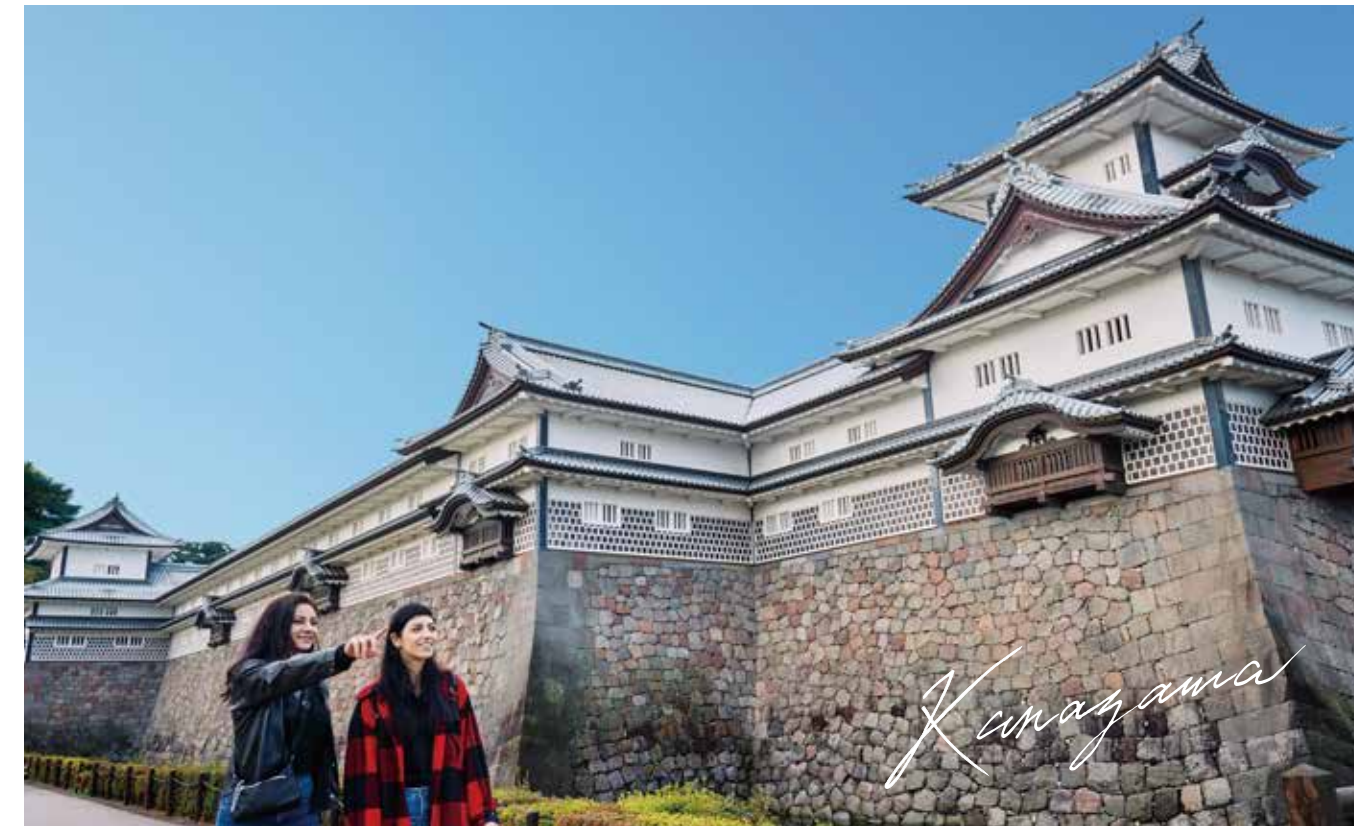
From Kanazawa to Mt. Hakusan Enjoy two nearby yet distinct areas in one trip

A day trip to the foot of the sacred Mt. Hakusan area from the castle town Kanazawa