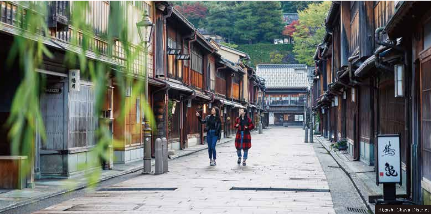
Higashi Chaya District