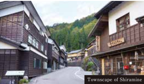
Townscape of Shiramine

Kanazawa, a castle town of a wealthy clan, and Shiramine, a village at the foot of Mt. Hakusan area and one of the snowiest areas in Japan. This route includes strolling around areas with a distinctive atmosphere, and getting a feel for the unique history and culture.